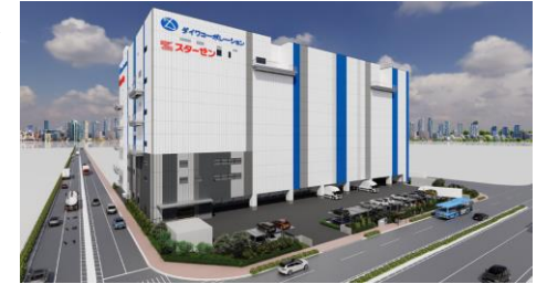
Group's core distribution base Higashi-Ogishima Center (scheduled to start operation in August 2026)